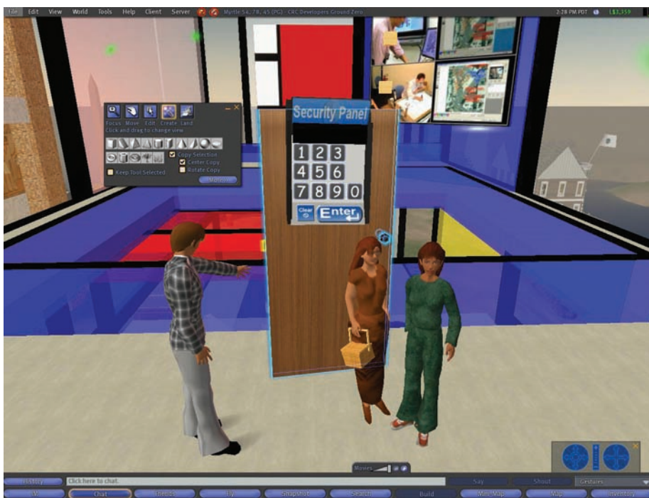
Fig. 2. Three avatars in SL making a door. In a virtual design studio, two scientists are admiring the work of a student intern (center) who is creating a set of displays demonstrating human-centered computing. After the combination lock has been set and made smaller, the door can readily be moved to its final location. Similar methods can be used to construct laboratory facilities and experimental equipment.

Political science uses the experimental method almost exclusively in small laboratory studies that mimic committee deliberations, and none of the social sciences experiment aggressively with social movements, simply because the cost and the ethical issues are daunting. This situation could change online, especially in role-playing games such as WoW, as long as the given experiment harmonized with the mythology of the virtual world. In the days before university committees on research with human subjects, it was not con-