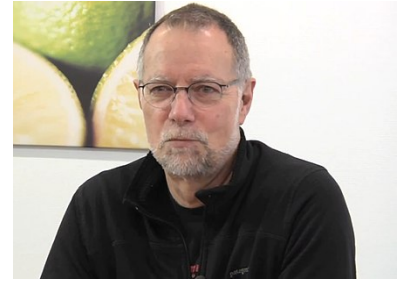
Robert H. Frank, 2013

Robert Harris Frank (born January 2, 1945) [1][2] is the Henrietta Johnson Louis Professor of Management and a professor of economics at the Samuel Curtis Johnson Graduate School of Management at Cornell University. He contributes to the "Economic View" column, which appears every fifth Sunday in The New York Times . Frank has published on the topic of wealth inequality in the United States . [3]