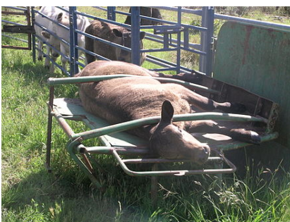
A calf cradle used for branding in Australia

Cattle may need to be deliberately thrown or tipped over for certain types of husbandry practices and medical treatment. When done for medical purposes, this is often called "casting", and when performed without mechanical assistance requires the attachment of 9 to 12 metres (30 to 40 ft) of rope around the body and legs of the animal. After the rope is secured by non-slip bowline knots, it is pulled to the rear until the animal is off-balance. Once the cow is forced to lie down in sternal recumbency (on its chest), it can be rolled onto its side and its legs tied to prevent kicking. [18][19]