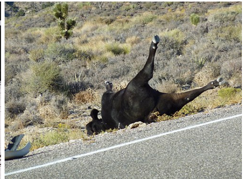
Bloat and rigor mortis combined result in a dead cow appearing "belly up".

Trauma or illness may also result in a cow unable to rise to its feet. Such animals are sometimes called " downers ." Sometimes this occurs as a result of muscle and nerve damage from calving or a disease such as mastitis . [26] Leg injuries, muscle tears, or a massive infection of some sort may also be causes. [27] Downer cows are encouraged to get to their feet and have a much greater chance of recovery if they do. If unable to rise, some have survived—with medical care—as long as 14 days and were ultimately able to get back on their feet. Appropriate medical treatment for a downer cow to prevent further injury includes rolling from one side to the other every three hours, careful and frequent feeding of small amounts of fodder , and access to clean water. [26]