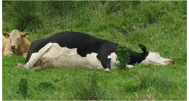
Cows routinely lie down to sleep.

Cow tipping is the purported activity of sneaking up on any unsuspecting or sleeping upright cow and pushing it over for entertainment. The practice of cow tipping is generally considered an urban legend , [1] and stories of such feats viewed as tall tales . [2] The implication that rural citizens seek such entertainment due to lack of alternatives is viewed as a stereotype . [3][4] The concept of cow tipping apparently developed in the 1970s, though tales of animals that cannot rise if they fall has historical antecedents dating to the Roman Empire .