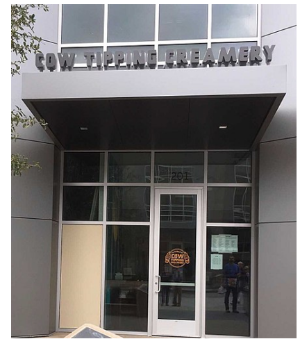
The Cow Tipping Creamery in Frisco, Texas