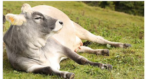
A healthy cow lying on its side is not immobilized; it can rise whenever it chooses.

Some versions of the urban legend suggest that because cows sleep standing up, it is possible to approach them and push them over without the animals reacting. [5] However, cows only sleep lightly while standing up, and they are easily awakened. [6] They lie down to sleep deeply. [7] Furthermore, numerous sources have questioned the practice's feasibility, since most cows weigh over 450 kilograms ( \frac{1}{2} short ton) and easily resist any lesser force. [6][8]