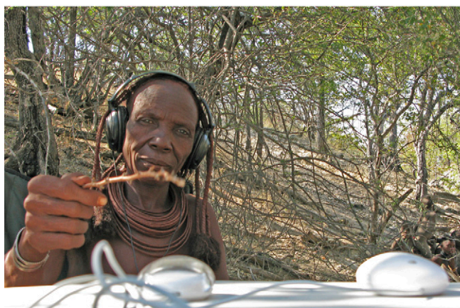
Fig. 1. Participant watching the experimenter play a stimulus ( Upper ) and indicating her response ( Lower ).

narios and does not require participants to be able to read. The English sounds were from a previously validated set of nonverbal vocalizations of emotion, produced by two male and two female British English-speaking adults. The Himba sounds were produced by five male and six female Himba adults, and were selected in an equivalent way to the English stimuli (13).