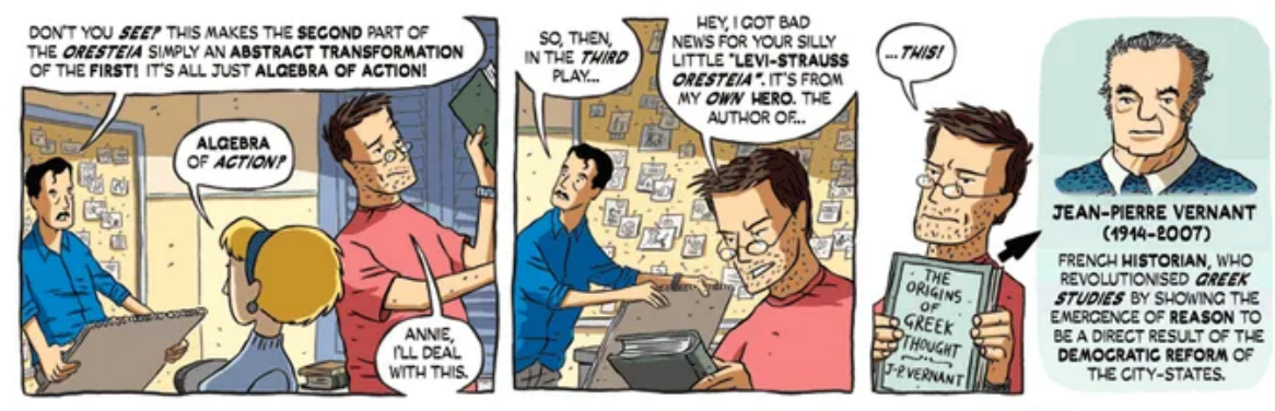
FOR VERNANT, UNLIKE THE MONOMANIAG LEVI-STRAUSS, ( SEES THE ORESTEIN IN ITS FULL CULTURAL CONTEXT! SO, IN THE THING PLAY, MYTH IS REPLACED BY REASON: A DEMOCRATIC THEY HEADER OUT SIDES AND VOTES!