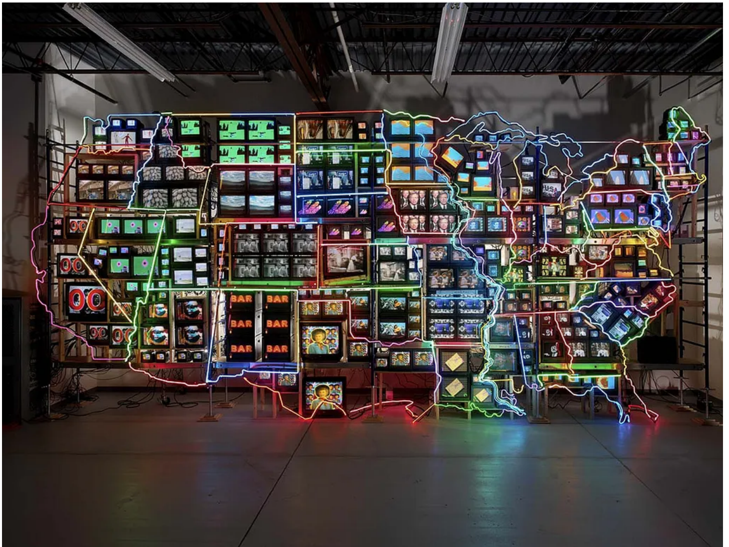
Artist: Nam June Paik, "Electronic Superhighway. Continental US, Alaska & Hawaii" (1995).