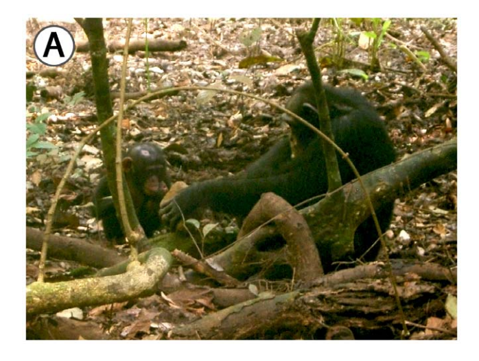
Figure 3. The adult male Porthos with his adopted female infant Gia. A) Porthos cracking and sharing nuts with Gia, B) Porthos carrying Gia on his back. doi:10.1371/journal.pone.0008901.g003

individuals. The high level of adoption observed in Taï chimpanzees compared to other well-studied East African populations might result from the fact that the Taï population coexists with a large population of leopards and the resulting high predation pressure exerted by these cats seems to have promoted strong within-group solidarity in the form of care for all injured individuals as well as joint coalition defense against the leopards [16,26]. Once established, this care for the welfare of others seems to have been generalized to new social contexts, including adoption [26]. Any discussions about the evolution of altruism must include the caveat that dissimilar socio-ecological conditions will lead to important population differences in both chimpanzees and humans and we need to remain very careful before making any claims about species differences.