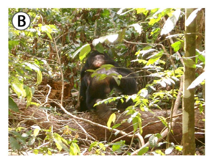
Figure 4. The adult male Porthos carrying on his back the adopted female infant Gia. doi:10.1371/journal.pone.0008901.g004

was observed in this group during the 9 years we followed them continuously. In 2000, the habituation of the East group was initiated and by February 2005, at least 11 adult males and 12 adult females were known to be present.